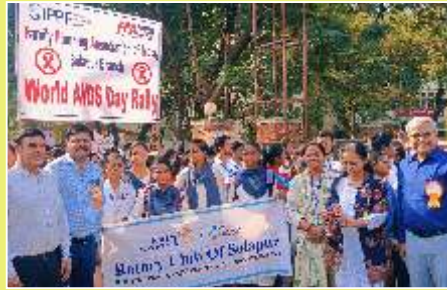
02 Dec 24 - AIDS Rally