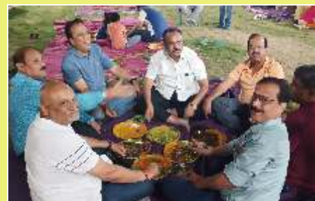
29 Dec24 - Fellowship Dinner and Hurda Party