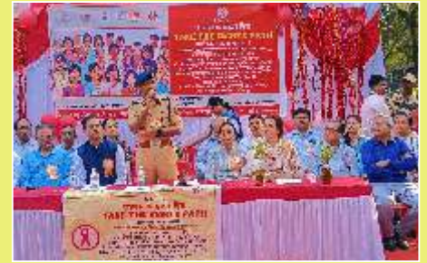
02 Dec 24 - Felicitation of NGO on AIDS Day