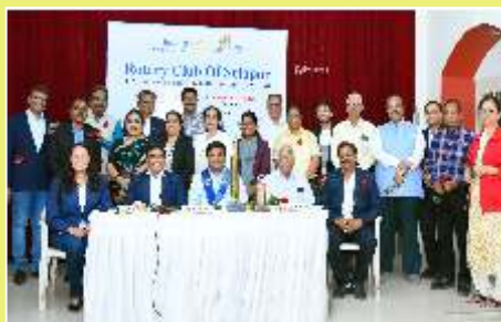
20 Dec. 24 - New BOD members