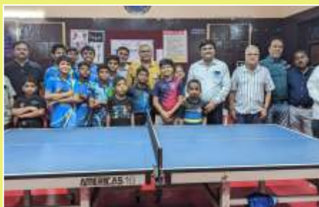
21 and 22 Dec. 24 - District Table Tennis Tournament