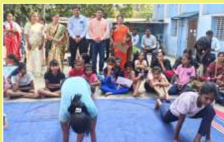
29 Dec.24 - District Yoga Competition