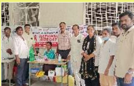
10 Dec 24 - Aids Week Health Check Up at Raghoji Transport