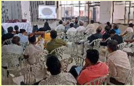
01 Dec 24 - CSR E Learning Training