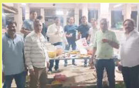
29 Dec24 - Fellowship Dinner and Hurda Party