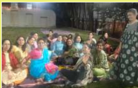
29 Dec24 - Fellowship Dinner and Hurda Party