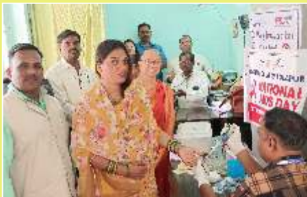
04 Dec 24 - Aids Health Check Up Camp at Niramay Dham