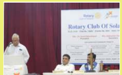
20 Dec. 24 - Declaration of New BOD