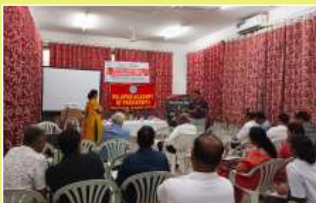
13 Dec24 - Visit of Paedetricians to RRTC