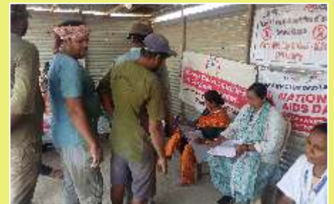
09 Dec24 - Aids Week Health Check Up