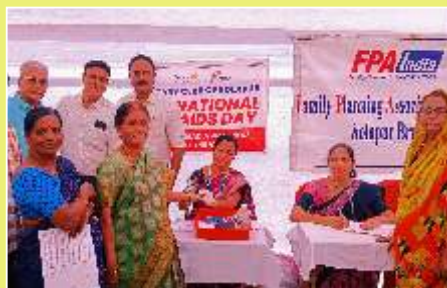
12 Dec 24 - Aids Week Health Check Up at Bhawani Peth